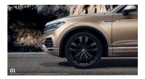
01 The stunning 21-inch 'Suzuka' alloy wheels add a unique finishing touch to the Touareg R-Line.

By design, the Touareg R-Line could not be better equipped, both inside and out, to handle whatever lies ahead. Numerous exterior features emphasise its dynamic character, from the distinctive 20 to 21-inch R-Line alloy wheels, 'C' signature 'Gloss Black' front air intake and 'R-Line' exterior styling pack with specially designed front and rear bumpers, body-coloured wheel arch protection, side skirts, and 'R-Line' badging on the front panels and front grille. The 'R-Line' styling ensures a dynamic exterior that delivers the highest levels of style and individuality.