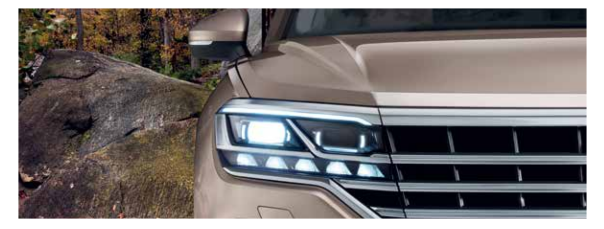
'IQ. Light' LED matrix headlights with intelligent light modes and Dynamic Light Assist provide greater illumination without dazzling other road users, while blending seamlessly into the wide front grille to give an unmistakable look.

The Touareg breathes fresh air into the premium SUV class with impressive new proportions, pioneering new technology and the widest range of assistance, handling and comfort systems ever integrated within a Volkswagen. A sporty elegant diffuser, dynamic LED rear tail lights and chrome trapezoid tailpipes create an athletic new look, underlined by striking 18 to 21-inch alloys depending on your chosen model. To the front, a wide assertive chrome grille extends into the headlights to create an even more dynamic appearance. Add to that an impressive specification, quality craftsmanship and the technologically advanced Innovision Cockpit that offers new levels of functionality and customisation – not to mention the ground-breaking optional 'Off-road' pack – and you can see why the Touareg is raising the bar once again.