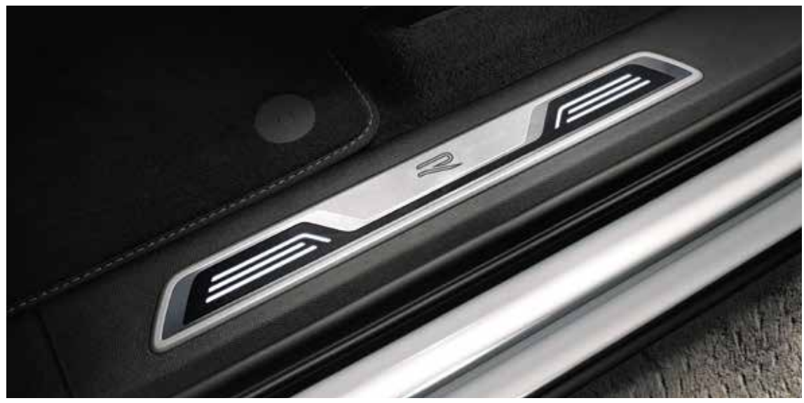
Creating an impressive welcome and hinting at the 'R-Line' interior styling to come, are the door sills in stainless steel with 'R-Line' logo for driver and front passenger doors.

As soon as you sit inside the Touareg R-Line, you'll appreciate the attention to detail and quality materials and finishes. Exclusive 'R-Line' styling includes a leather trimmed multifunction steering wheel with 'R-Line' logo, stainless steel pedals and 'Wave' aluminium decorative inlays in the dash and doors. Front ergoComfort seats with 14-way adjustment can be specified in 'Savona' leather, featuring the distinctive 'R-Line' logo on the seat backrests and decorative stitching, while 'Soul' black rooflining and 'R-Line' stainless steel front door sill protectors provide the finishing touches.