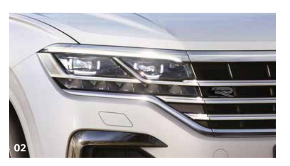
02 The unique 'R-Line' badging on the radiator grille sets yet another sporty accent and underlines the striking exterior design of the Touareg R-Line.